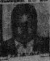
Portrait of a man, likely a government official.

The computer training program, which will be conducted by the Ministry of Education, is expected to start in the near future.